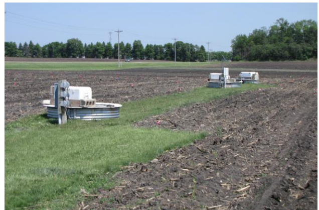
Plots to collect drainage water were established at the Southern Research and Outreach Center in Waseca in 1975. The collection of data was automated in 2009.

Research data on nitrate loss from cropping systems through drainage systems is not as common as one might think. In Minnesota there are plots used to measure drainage water quantity and quality located at the University of Minnesota Research and Outreach Centers in Waseca (SROC) and Lamberton (SWROC). These were established in the early 1970s. In the nearly 40 years that these plots have been used, they have examined many of the aspects of N management including: rate, application timing, source, and the use of nitrification inhibitors. In addition, they have looked at various crops grown in rotation, tillage practices, and mineralization of N from soil organic matter.